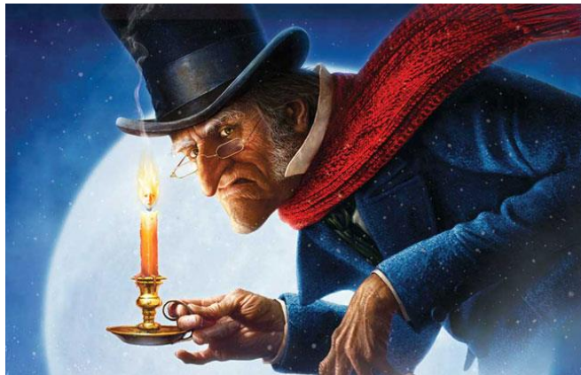
Image credit: The Further Adventures of Ebenezer Scrooge by Charlie Lovett